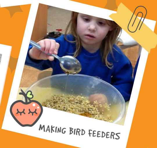
MAKING BIRD FEEDERS