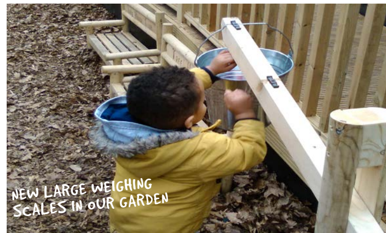
NEW LARGE WEIGHING SCALES IN OUR GARDEN