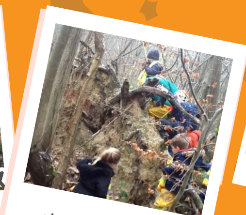
CLIMBING & CREEPING