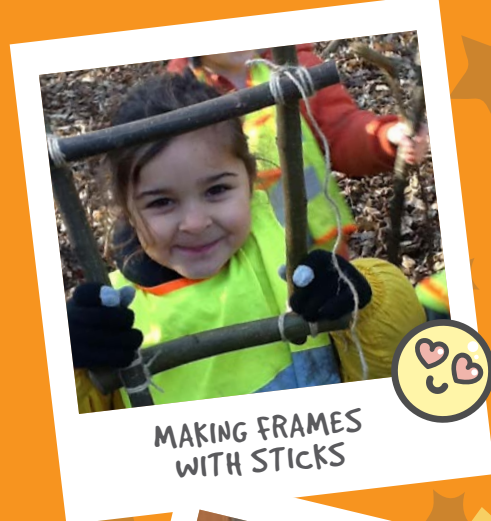
MAKING FRAMES WITH STICKS