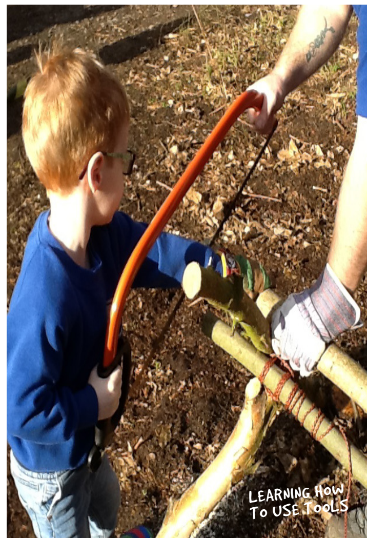
LEARNING HOW TO USE TOOLS