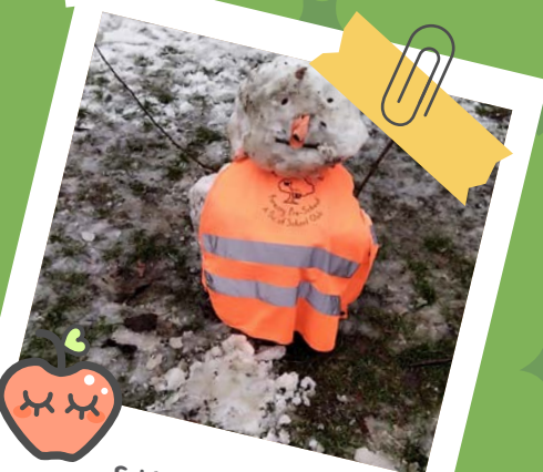
ENJOYING THE SNOW