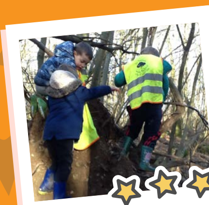
LOOKING FOR BIRDS