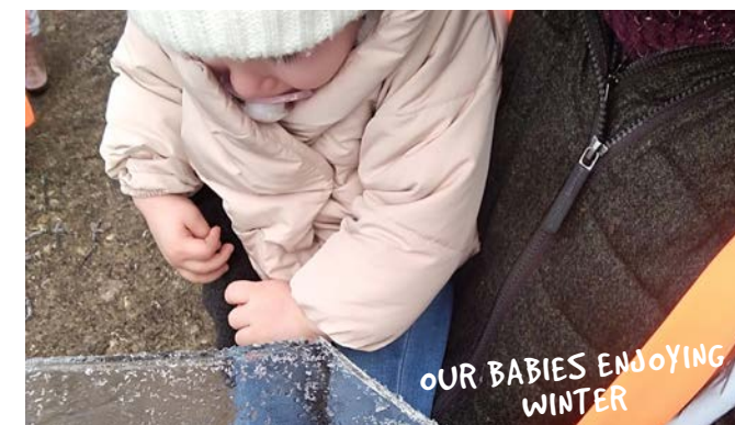
OUR BABIES ENJOYING WINTER