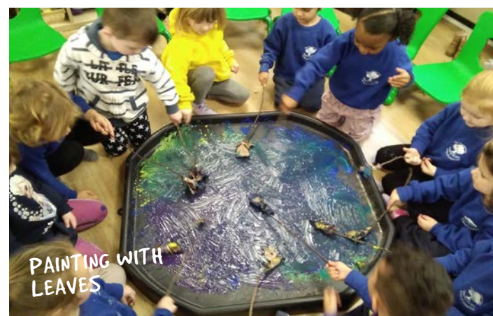
PAINTING WITH LEAVES